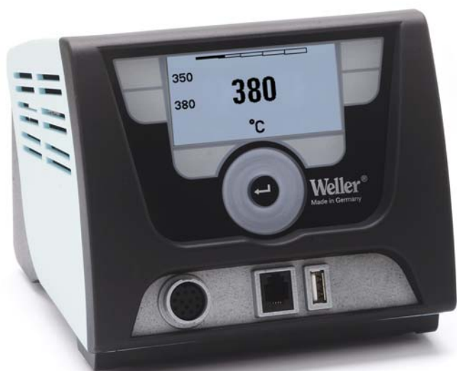
Soldering station WX 1