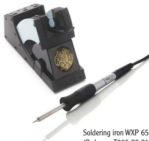
Soldering iron WXP 65 Set (Order-no.T005 29 212 99)