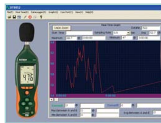
PC Software included