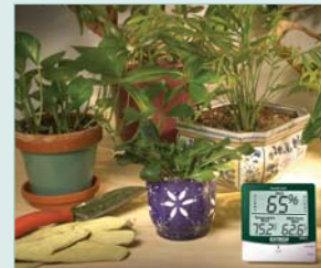
Checks the Humidity and Temperature levels for optimal plant growth in greenhouses.