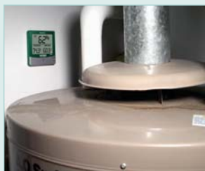
Monitoring Dew Point levels in a Basement for potential mold growth.