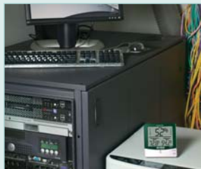
Alerts low Humidity levels in Computer rooms to help prevent electrostatic conditions.