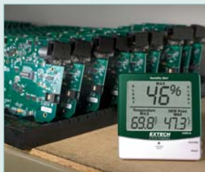
Indicates Humidity and Temperature levels in Production areas.