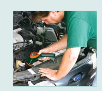
Measure temperature in hard to reach places